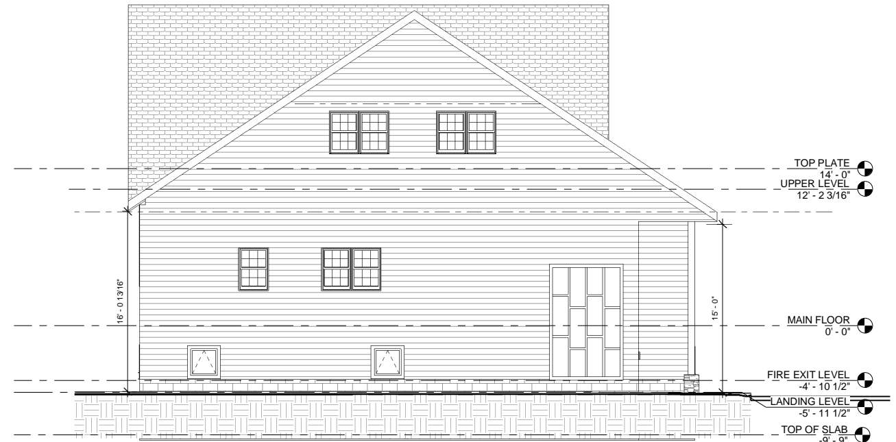
② LEFT ELEVATION 3/16" = 1'-0"