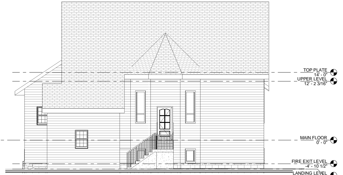
③ RIGHT ELEVATION 3/16" = 1'-0"